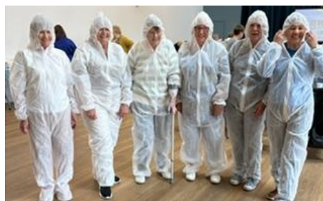
The Forensic Experience Can you guess who is who?