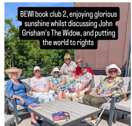
BEWI book club 2, enjoying glorious sunshine whilst discussing John Grisham's The Widow , and putting the world to rights