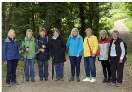
Our Walking Group on the way to Edwins for coffee